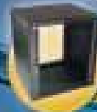
19-inch Wall Mount Cabinets